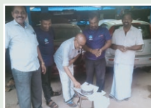
Grams Maruti Service Land, Calicut (West Bengal)