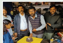
Raj Honda Care, Jaipur (Rajasthan)