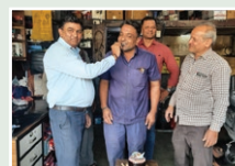
Tulsi Auto Garage, Surat (Gujarat)