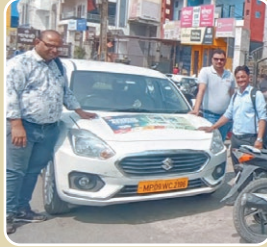
Indore (Madhya Pradesh)