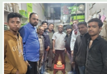
Praful Auto Centre, Bhavnagar (Gujarat)