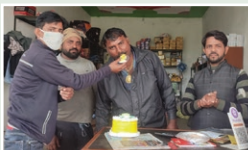
Pankaj Auto Engineering Works, Mainpuri (UP)