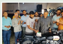
Shiva Bike Workshop, Jaipur (Rajasthan)