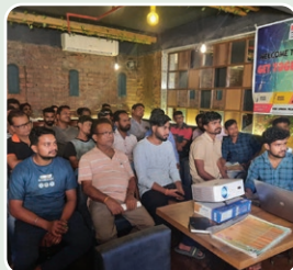
Kolkata (West Bengal)