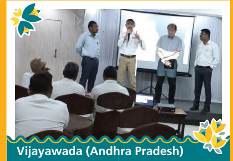
Vijayawada (Andhra Pradesh)