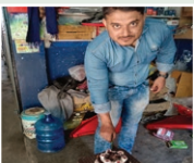
Munna repairing centre, Varanasi (UP)