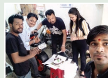
Lalit Auto Service, Indore (Madhya Pradesh)