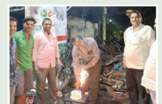
Vimal Auto Works, Patna (Bihar)