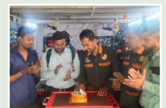
Mangalmurti Honda at Kolhapur (Maharashtra)