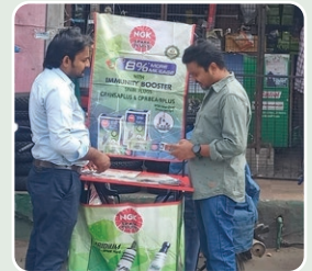
Vijayawada (Andhra Pradesh)