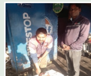
Raju Servicing Centre, Ramgarh (Jharkhand)