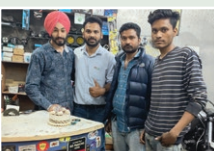
Sehgal Auto Electrical, Patiala (Punjab)