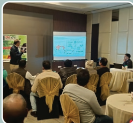
Gorakhpur (Uttar Pradesh)