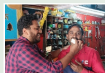
Sri Vinayaka Motors, Bangalore (Karnataka)