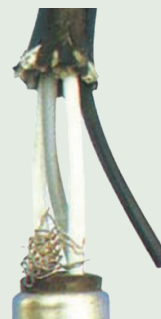
Broken lead wire