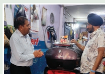
Simri Automobile, Nagpur (Maharashtra)