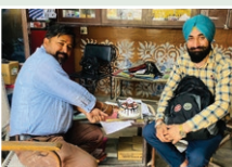
Brahm Motor's, Jalandhar (Punjab)