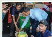
Jiten Scooter & Motorcycle Works, Guwahati (Assam)