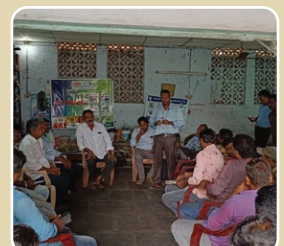
Vijayawada (Andhra Pradesh)