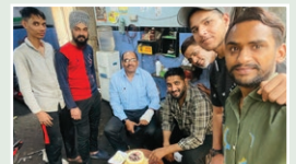
Saifi Bike Point (Delhi)