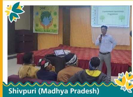
Shivpuri (Madhya Pradesh)