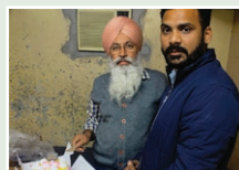
Harpal Motors, Chandigarh (Punjab)