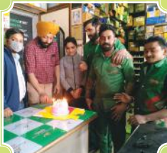
Gurmeet Motors, Ludhiana (Punjab)