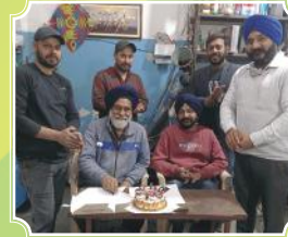
Jolly Motors, Jalandhar (Punjab)