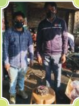
Raju Servicing Centre, Ramgarh (Jharkhand)