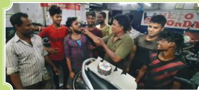
M.H. Automobiles, Chennai (Tamil Nadu)