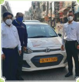
New Delhi (Delhi)