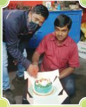
Mobike Care, Guwahati (Assam)