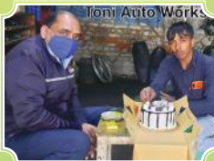
Toni Auto Workshop, Narela (Delhi)