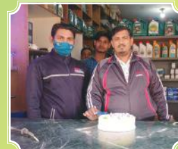
Max Automobiles, Noida (U.P.)