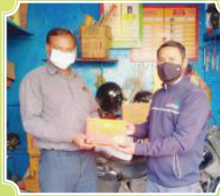
Vimal Auto Works, Patna (Bihar)