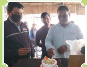
Surendra Service Centre, Mau (U.P.)