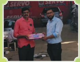
Friend's Automobiles Company, Jaipur (Rajasthan)