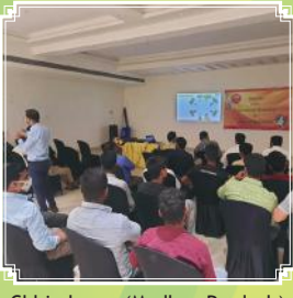
Chhindwara (Madhya Pradesh)