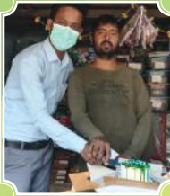
Nath Bike Repairing Centre, Guwahati (Assam)