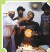
A-One Autos, Calicut (Kerala)