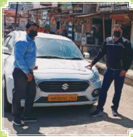
Indore (Madhya Pradesh)