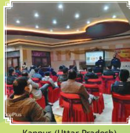
Kanpur (Uttar Pradesh)