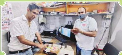
Car Gas Points, Pune (Maharashtra)