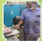
Vel Motors, Vellore (Tamil Nadu)