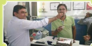
Patel Motors Garage, Surat (Gujarat)