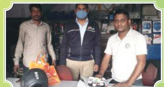
Vasant Auto Centre, Nagpur (Maharashtra)