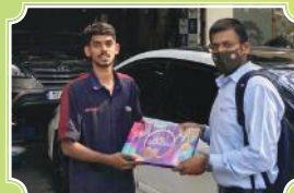
Moto Mech, Mumbai