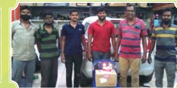
Sri Lakshmi Ganapati Motors, Visakhapatnam (A.P.)