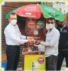
New Delhi (Delhi)