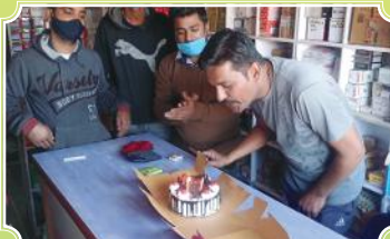
Rakesh Auto Spare & Parts, Jodhpur (Rajasthan)