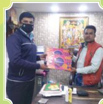
All in One Motor, G.T. Karnal Road, (Delhi)