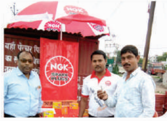
Corner Meet conducted at Patna