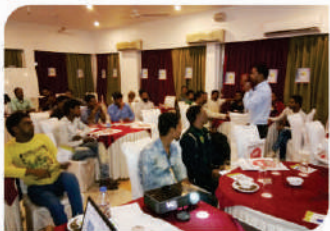
Mechanic meet conducted at Sehore, MP