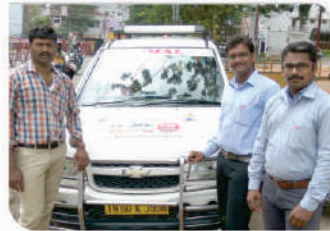
Van Campaign conducted at Tamil Nadu