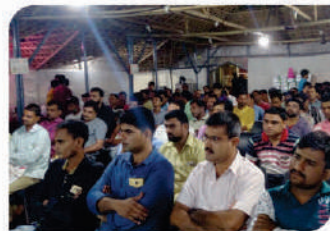
Mechanic meet conducted at Una (Rajkot), Gujarat