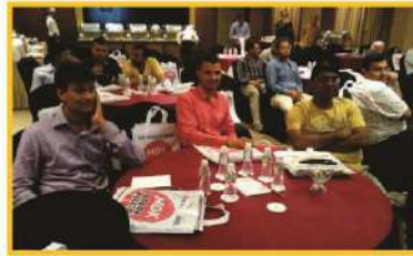
Association meet conducted at Ahmedabad, Gujarat