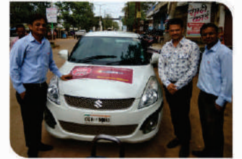
Van Campaign conducted at Chattisgarh