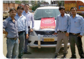
Van Campaign conducted at Chandigarh