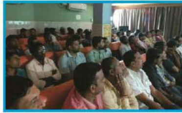
Mechanic Meet with ATS Japan