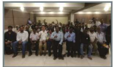
Association meet conducted at Belgaum, Karnataka