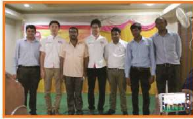
Market visit of ATS team