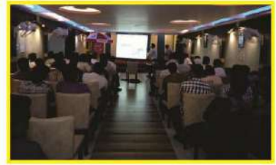
Association meet conducted at Kadappa, Andhra Pradesh