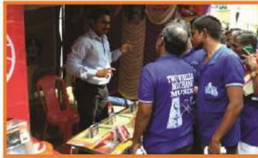
Association meet conducted at Trichi, Tamil Nadu