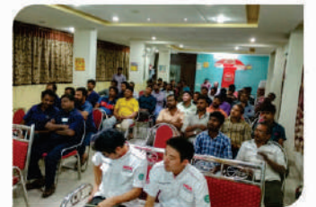
Mechanic meet conducted by ATS team