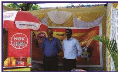
Association meet conducted at Coimbatore, Tamil Nadu