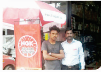
Corner Meet conducted at Calicut