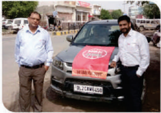
Van Campaign conducted at Haryana