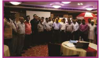
Association meet conducted at Kolkata, West Bengal