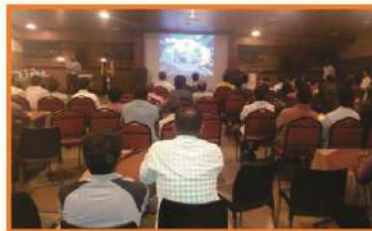
Association meet conducted at Hubli, Karnataka