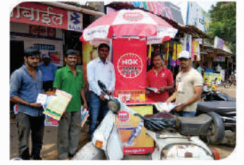
Corner Meet conducted at Kolhapur