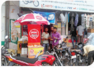
Corner Meet conducted at Barmer