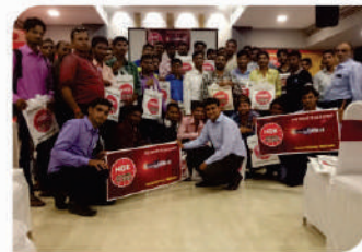
Mechanic meet conducted at Raigarh, Maharashtra